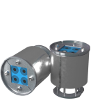
SLA R 100/4 AISI316