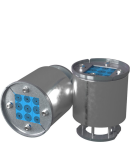
SLA R 100/9 AISI316