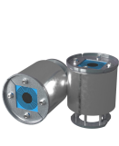
SLA R 100/1 AISI316